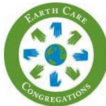
A program of the Presbyterian Church (USA)