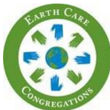
A program of the Presbyterian Church (USA)