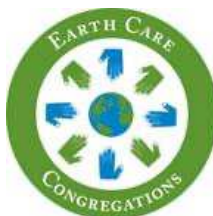
A program of the Presbyterian Church (USA)